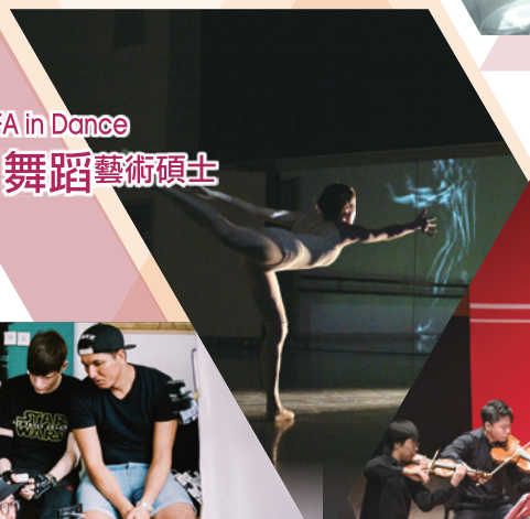
MFA in Dance 舞蹈藝術碩士