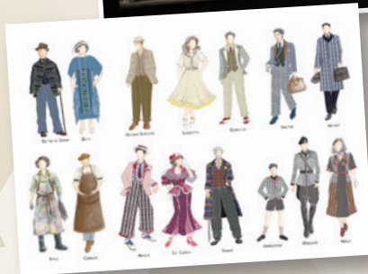
Sketches of set and costume design by students of School of Theatre and Entertainment Arts. 舞台及製作藝術學院學生之佈景及服裝設計草圖。