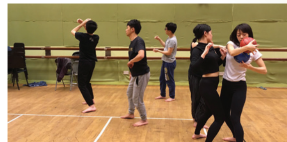
Students of the School of Drama rehearsing for the performance. 戲劇學院學生為演出排練。

由 Simon Stephens 編創的《魔零》，劇本的大膽與震撼度，與其縝密又令人不安的編排如出一轍。他與倫敦 Hammersmith Theatre 的一群年青人一起創作這齣為他們度身訂造的劇目，並於 2012 年愛丁堡藝術節上演時大獲好評。此劇探討青少年無動機的惡意行為，他們覺得自己被困於一個沒有意義的世界裡。與現今好些戲劇及電影一樣，此劇表達了青少年向朋輩、兄弟姊妹及陌生人大模斯樣干犯各樣暴力罪行的心態，但另一方面 Simon Stephens 亦透過與年青人共同創作，帶出令人深思的真實狀況，從而引發共鳴，讓觀眾去思考及見證這一代的行為，了解他們其實極度迷失，仍要一直追求著無止境的答案。 ♪