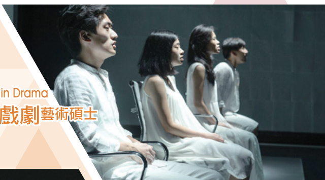
MFA in Drama 戲劇藝術碩士