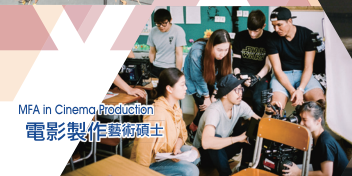
MFA in Cinema Production 電影製作藝術碩士